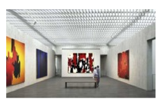
The Clyfford Still Museum www.clyffordstillmuseum.org