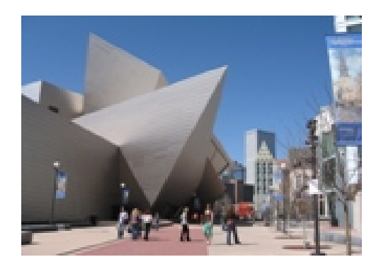
Denver Art Museum www.denverartmuseum.org