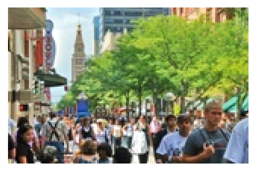
16th Street Mall - Pedestrian Mall Restaurants & Outdoor Cafes Shopping Pubs Galleries Horse-drawn Carriages (after dark)