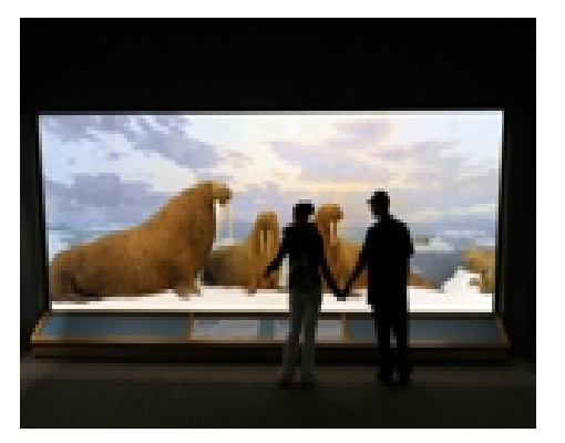
Denver Museum of Nature & Science www.dmns.org

The fourth largest museum in the U.S. is a maze filled with treasures of the earth – dinosaurs, dioramas, space exhibits, science experiments, a digital planetarium, IMAX theatre and touring shows.