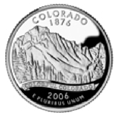
U.S. Mint www.usmint.gov/mint_tours/index.cfm?action=StartReservation