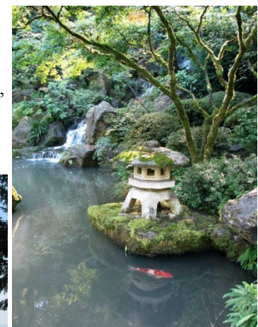
out throughout Portland.

One tour that showcases Portland's history is the fountain tour.