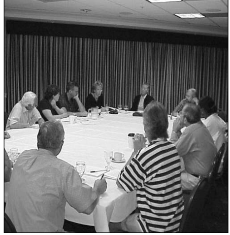
The WSSA leadership brainstorms during one of their fall meetings.

As immediate Past-President of WSSA, I serve as chair of a Nominating Committee for next year's election of