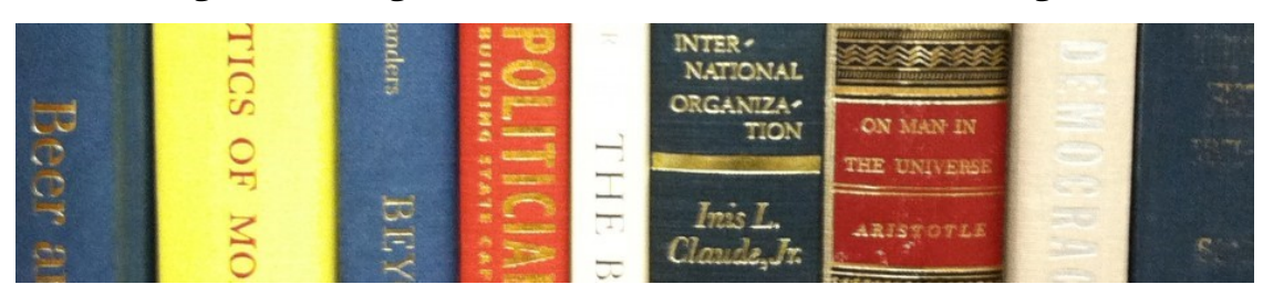
Founded in 2013