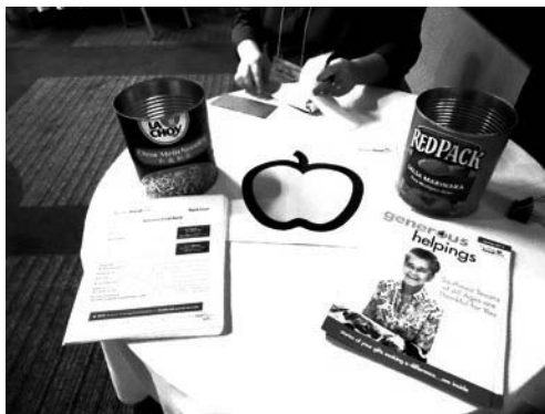
Food Bank donations