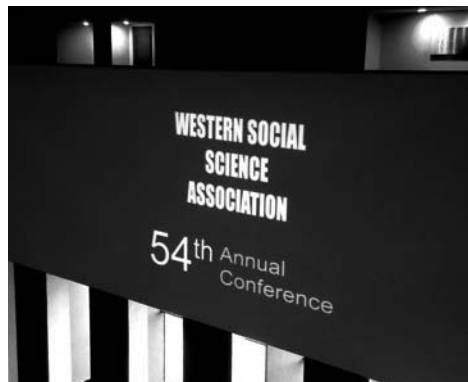
Hyatt Houston welcomes WSSA