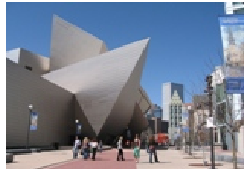
Denver Art Museum