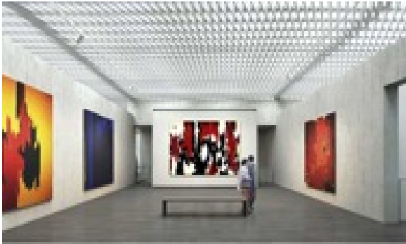
The Clyfford Still Museum www.clyffordstillmuseum.org