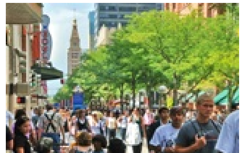
16th Street Mall - Pedestrian Mall