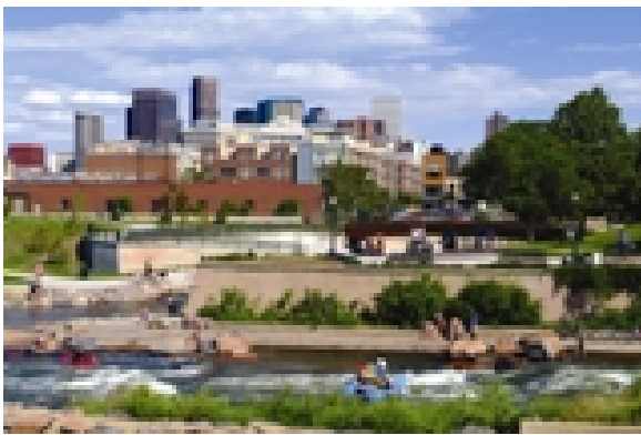
Confluence Park http://www.greenwayfoundation.org