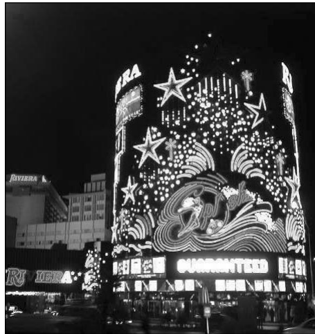
WSSA conference attendees will enjoy the Riviera Hotel and Casino.

The 45th Annual WSSA conference in Las Vegas is coming together as a showcase of our Association's interdisciplinary strength. There are many scholarly papers from a wide variety of disciplines which will be presented during the conference. Concurrent panel presentations from our 30 sections are scheduled from 8:00 a.m. to 6:00 p.m. on Thursday, April 10; Friday, April 11; and Saturday, April 12. We have a couple of special topics that are noteworthy to mention. On Thursday we have a special presentation from the Criminal Justice and Criminology section entitled "Star Trek: Visions of Law and Justice in Teaching." This seems appropriate given that the Riviera is housed right next door to the Star Trek experience of Las Vegas. Each year we offer a special panel on "Publishing in The Social Science Journal ." We encourage our membership to consider their scholarly work for publi-