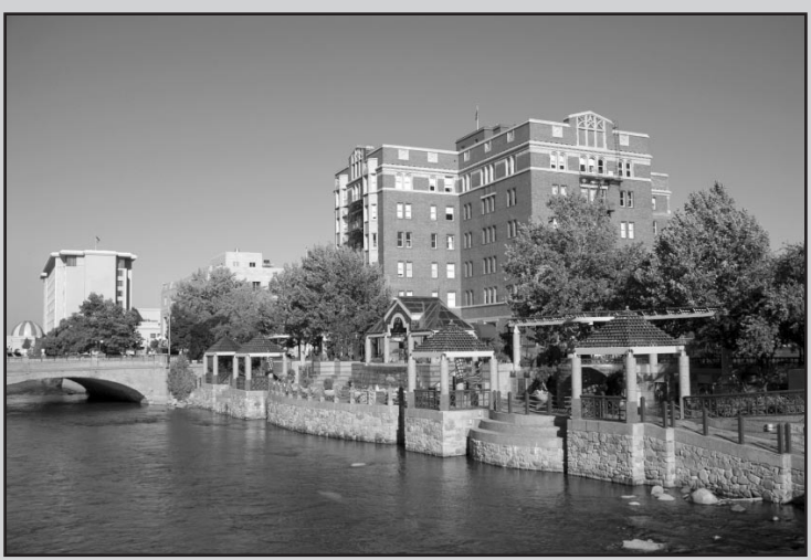
The Truckee River, Reno, NV

Reno, Nevada, may not be on the way to "everywhere" but it is certainly a convenient destination to get to regard-