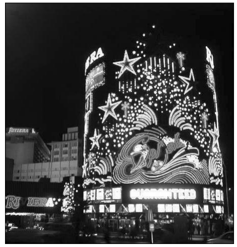
WSSA conference attendees will enjoy the Riviera Hotel and Casino.

he 45th Annual WSSA conference in Las Vegas is coming together as a showcase of our Association's interdisciplinary strength. There are many scholarly papers from a wide variety of disciplines which will be presented during the conference. Concurrent panel presentations from our 30 sections are scheduled from 8:00 a.m. to 6:00 p.m. on Thursday, April 10; Friday, April 11; and Saturday, April 12. We have a couple of special topics that are noteworthy to mention. On Thursday we have a special presentation Justice from the Criminal Criminology section entitled "Star Trek: Visions of Law and Justice in Teaching." This seems appropriate given that the Riviera is housed right next door to the Star Trek experience of Las Vegas. Each year we offer a special panel on "Publishing in The Social Science Journal." We encourage our membership to consider their scholarly work for publi-