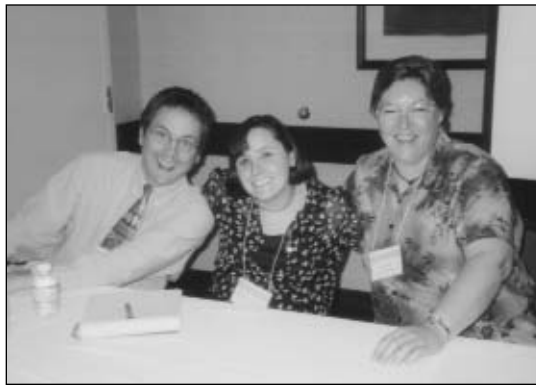
Student presenters and attendees have always been an integral part of WSSA conferences.

The WSSA Executive Council will be hosting a short reception at the Salt Lake City Conference for former presidents of the Western Social Science Association. The reception will be held on Friday evening of the conference from 5 to 6 p.m. All former presidents are invited.