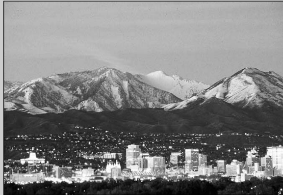
Downtown Salt Lake City offers majestic views of the surrounding mountain ranges, especially in winter.

The LDS Church Office Building: Worldwide headquarters of The Church of Jesus Christ of Latter-Day Saints. The 26th floor is an observation deck with views