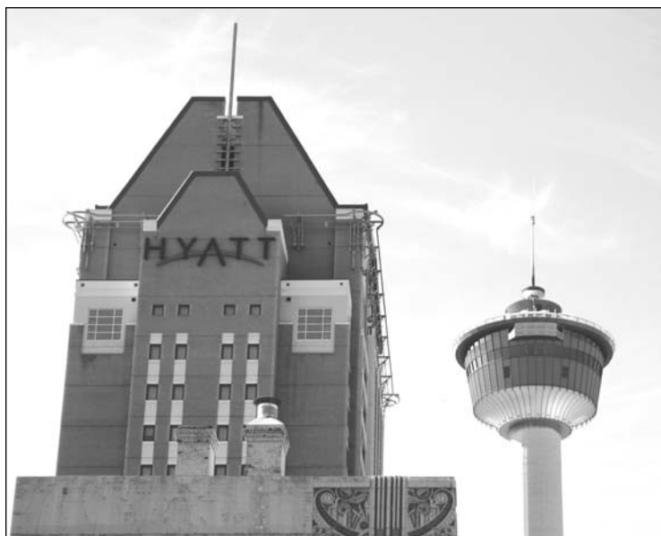
A picturesque view of the Hyatt Regency in Calgary, Alberta.