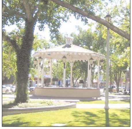
Historic Old Town Albuquerque

he WSSA's 47th Annual Conference in Albuquerque is fast approaching. Even if you are not presenting a paper or performing other conference duties, plan on joining us for another great conference. Thanks to all of you (especially the wonderful section coordinators) who have helped organize the program for the upcoming conference. The program is extensive and exciting. We have about 260 panels and approximately 1,000 different individuals listed in the program. There should be something for everyone. As you can see from the program overview on page 4, we have several special events planned, including open receptions on Wednesday and Saturday, ticketed luncheons on Thursday and Friday, and other special sessions. On Thursday, WSSA President Lisa Nelson will deliver her presidential address and the awards for best student papers will be presented.