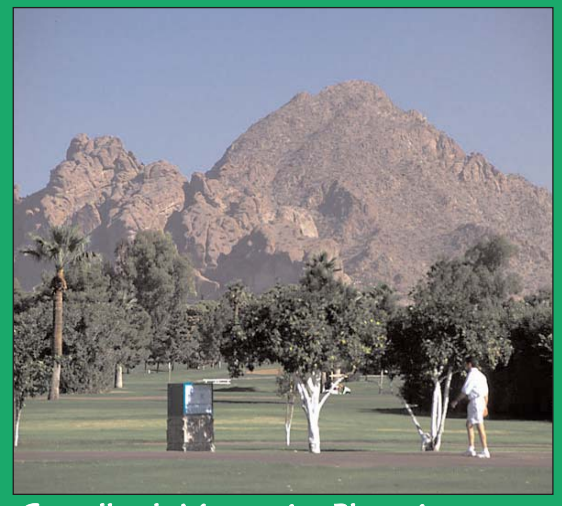
Camelback Mountain, Phoenix