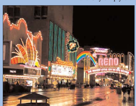
Is Reno the answer to the conference question?

want any of the people who dont like casinos to think that we are not paying attention to you. We are. In fact, by the time we get to Reno in 2010, it will have been about 10 years between casino visits as opposed to once every 3 years on average in the 1990s.