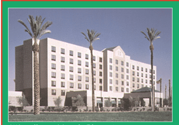
Wyndham Hotel, Phoenix